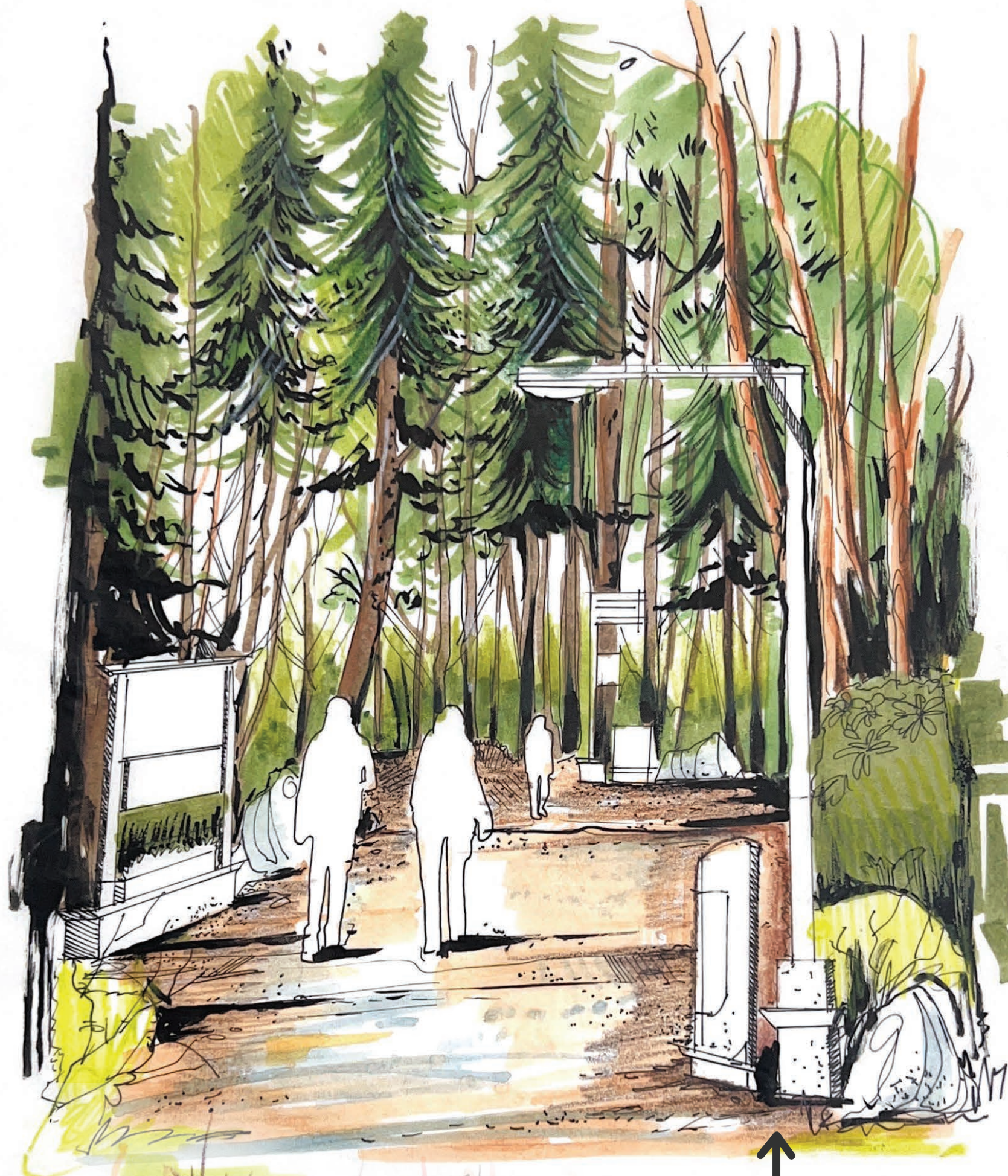
Top Perspective - Depicts one of the many trail intersections with better trail management, and way-finding signs to help direct trail-goers.