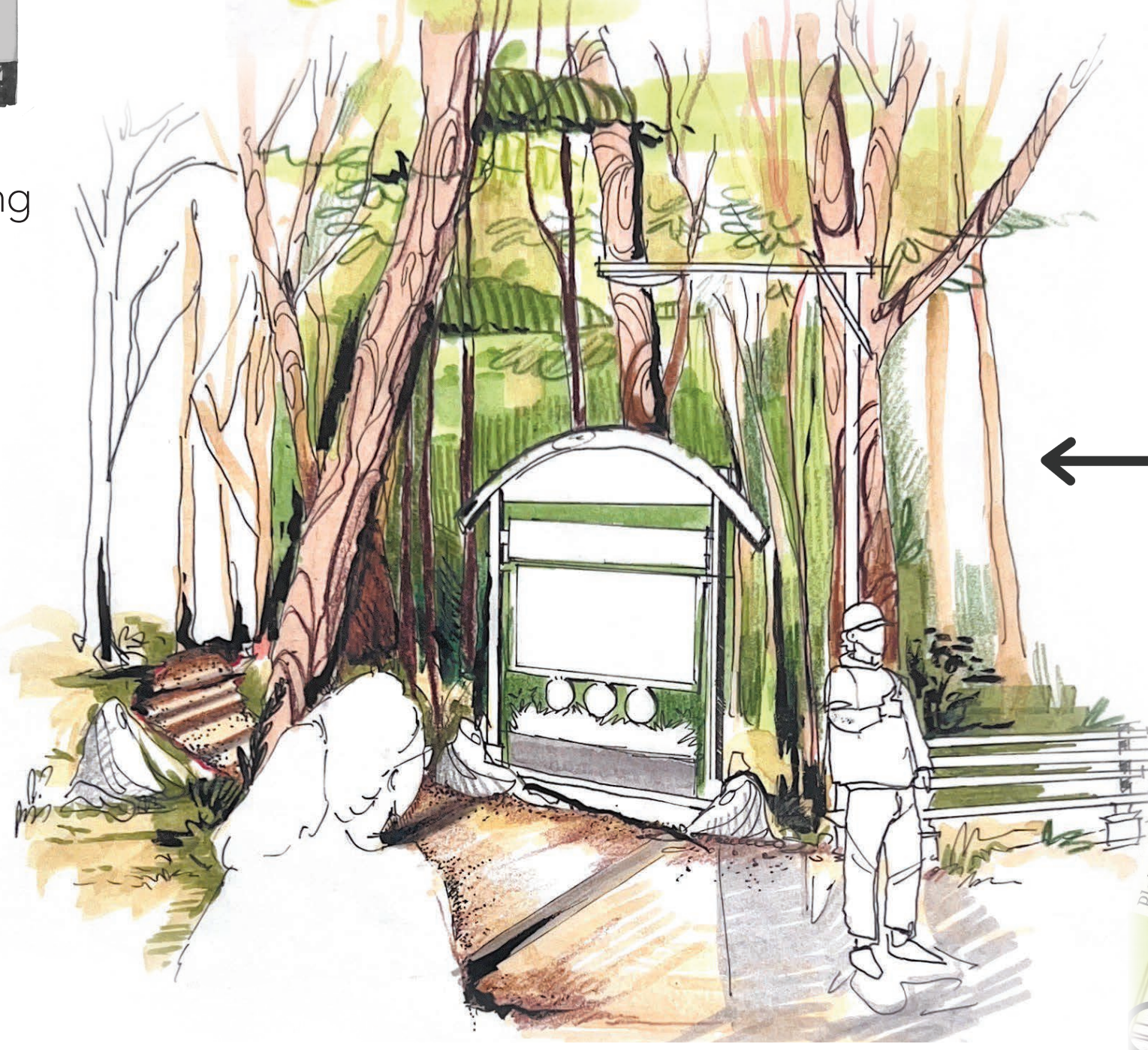
Left Side Perspective - Depicts the Flagg Rd. entrance into the woods, complete with a large welcoming sign and benches.