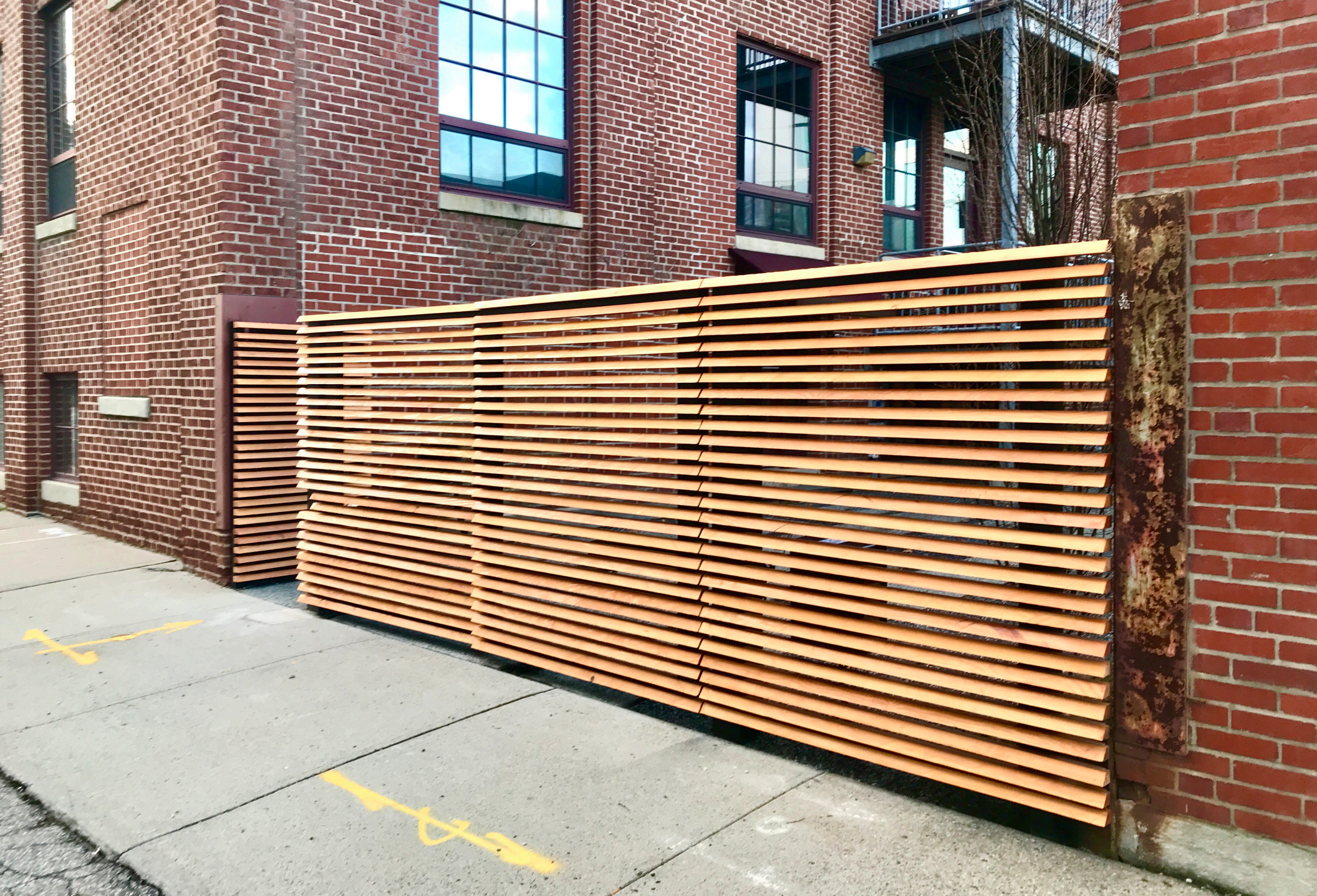
View from Ship Street of the custom gate/privacy screen.