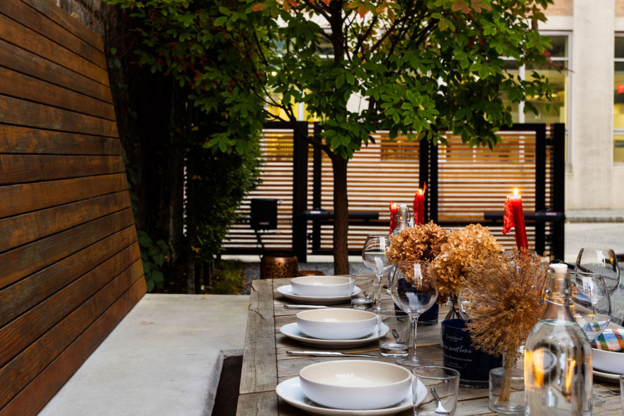
View from the dining table looking at the custom automatic gate.