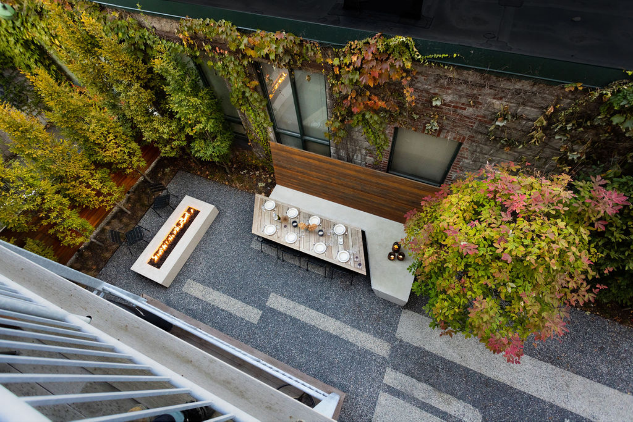
View into the garden from a third floor balcony.