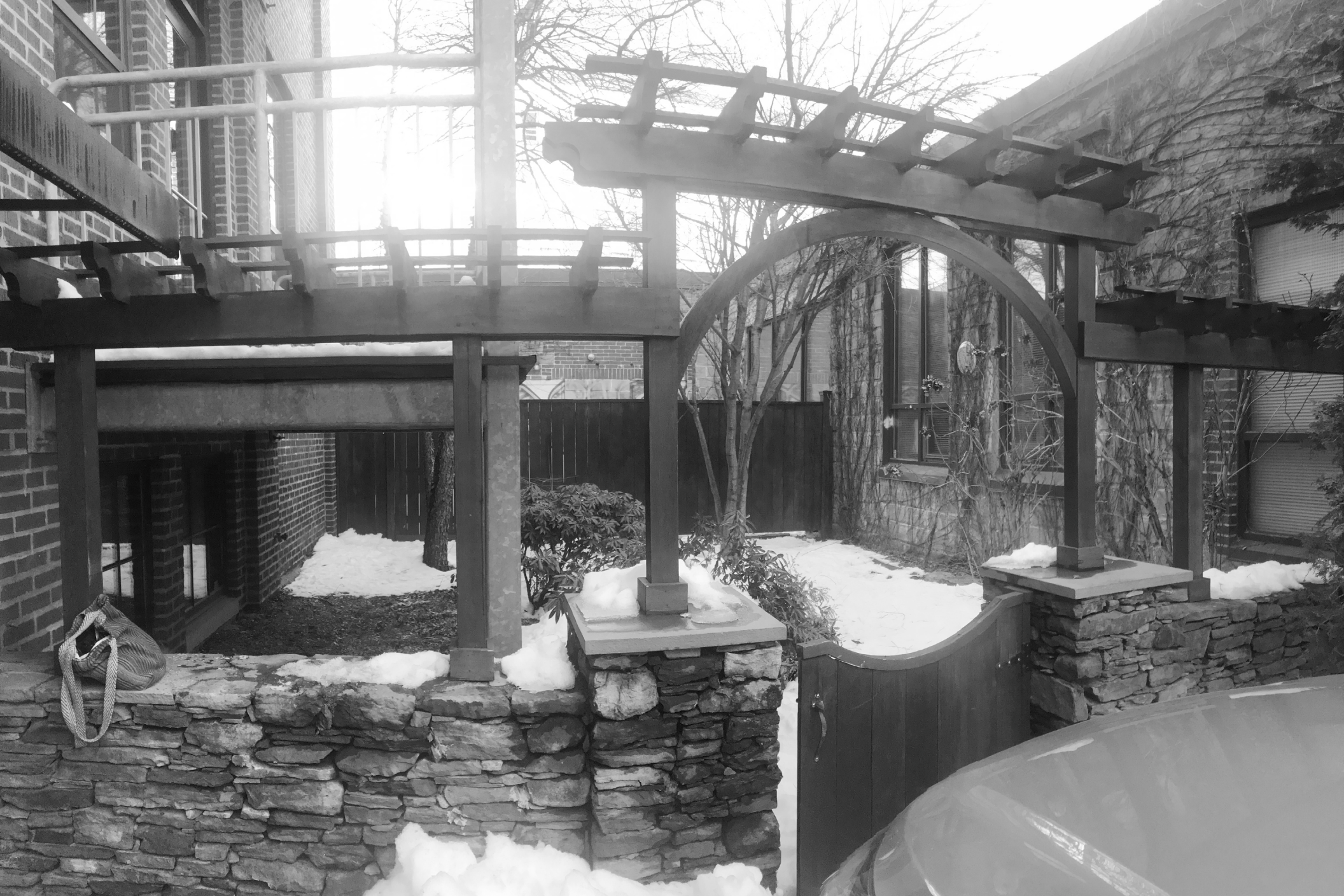
Photograph of the existing conditions of the garden.