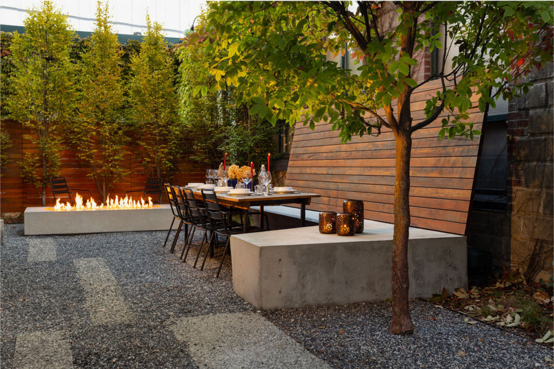
An Acer griseum and custom concrete seating define the outdoor dining and fire pit area. The backrest for the seating doubles as a screen from the neighboring office windows.