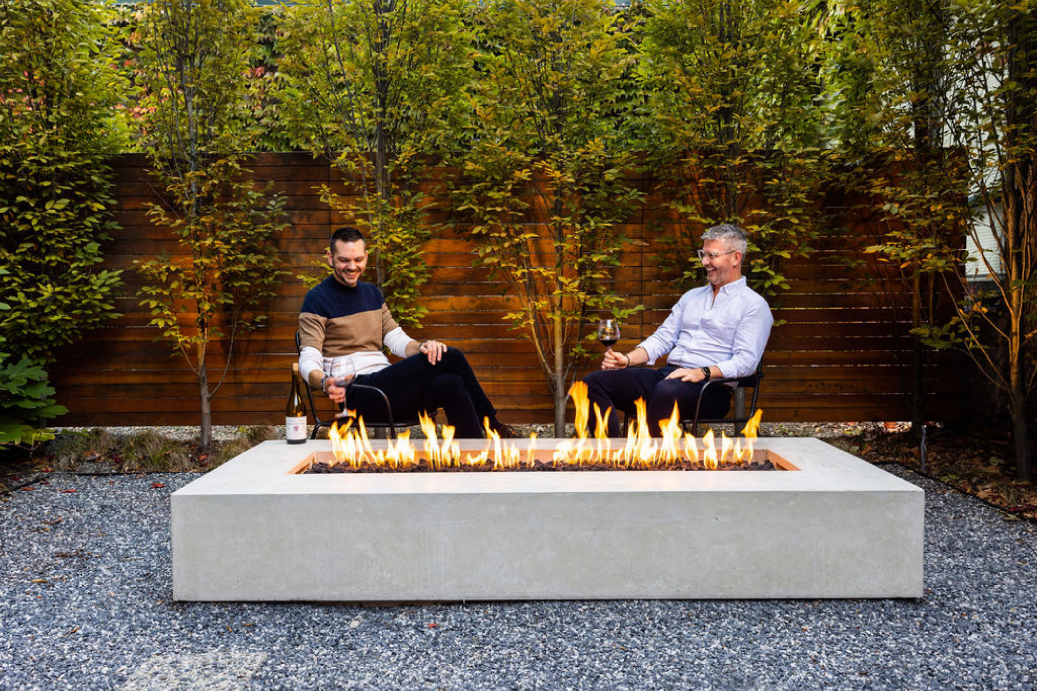
The clients enjoy a glass of wine at the concrete fire pit.