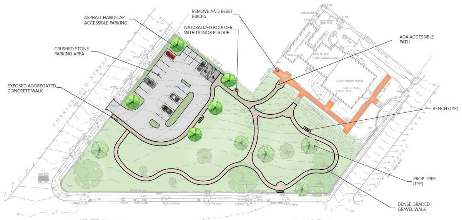
Conceptual Plan by BETA