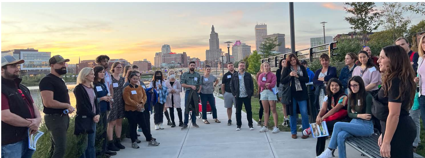
The RI ASLA Walking Tour